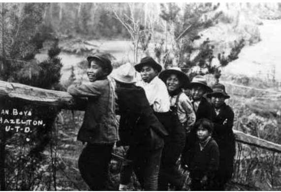
c. 1914: Trading post village of Hazelton, B.C. – Royal Bank branch relocated from the village to Hagwilget First Nation in 1977