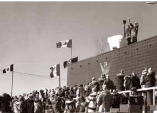
1978: Arctic Winter Games, Hay River, NT — supported by RBC since 1977