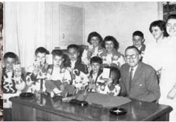
1961: Nine new clients open Royal Bank accounts in Terrace, B.C.