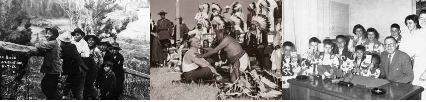
c. 1914: Trading post village of Hazelton, BC -Royal Bank branch relocated from village to Hagwilget First Nation in 1977