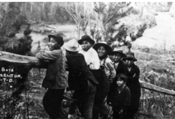
c. 1914: Trading post village of Hazelton, BC – Royal Bank branch relocated from village to Hagwilget First Nation in 1977