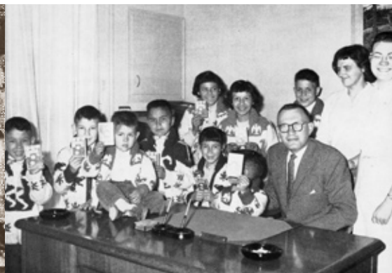
1961: Nine new clients open Royal Bank accounts in Terrace, BC