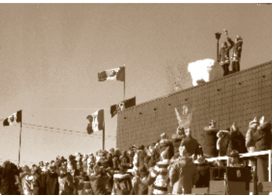
1978: Arctic Winter Games, Hay River, NT – supported by RBC since 1977