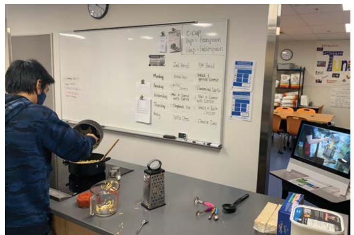
Wiaqa'luemk ekina'muemk tel-toqtemk