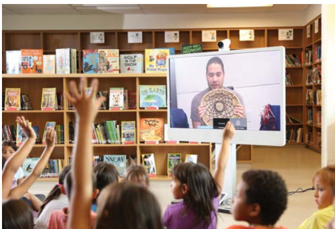
L'nu Nikanawti'ket Mine Centre Kina'matnewo'kuo'm, Ontario

Tan teligtjitasig tan teotji oelogege na tan teloatitjig notji ginamoatitjig tan naspoltitjig ola program.” Tan niin tel nemito tan teotji gelolg ola Connected North Program ag tan teli apogenoatj mitjoatitjig na telategeg oetjiag elnoigtog ag elnog. Ola paseg negemeoei na mesgig teloag, gato otjit etl ginamasoltitjig ,togo pogelg elno, na igenematj gelosoltitjig elnog tan oitjei teloltitjig stige negemog, gisatotoitj logeoagen tan etogtjel negemog telatag” teloet neotetjit Connected North notji ginamatg.