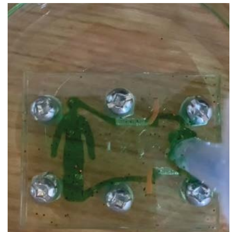
Koqoey elakwek Kina'masutiey wijt tel-kiwto'qa'sik mal'tew wen wtinink