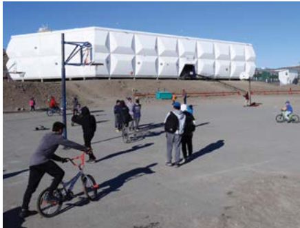
Nakasuk Kina'matnewo'kuo'm Iqaluit Nunavut

Tan teligenag ne me pemigenag tan tel pemiag. “ Mesgig nemito tan teligenasig, oetjiag paseg 5 ginamoôgomel nige piamio 100 tam naspoltoitjig ag eoegetotitjig ola program.” Oeltetemeg getjitoeg 91.8 % notji ginamoatitjig teltasoltitjig apogenmagoititj Connected North siaologititj ginamating ag sioischooleooltineo.” Teloet Corriero.