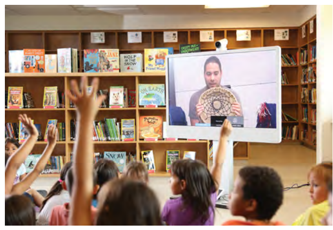
Indigenous role model at Mine Centre School in Ontario

The proof of the impact comes from the testimonials of the educators who have been involved with the program. "One of the largest impacts I have seen that the Connected North program has had on my kids is that it has delivered Indigenous content from Indigenous people. This alone is huge, but for my student population who is largely Indigenous, it gives them positive role models that look like them and have similar stories to them. For them to be able to see people who look like them, with similar life stories to them, succeed in a field that they may also enjoy is powerful," a Connected North teacher shares.