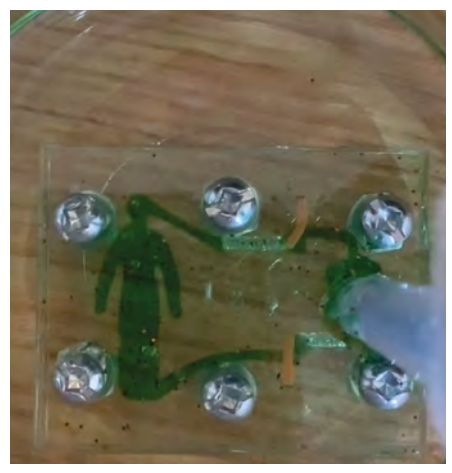
Circulation STEM kit