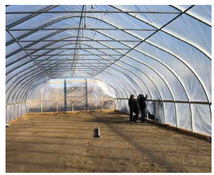
Greenhouse build at Muskoday First Nation — Muskoday First Nation members and Enactus Lambton College students building together.