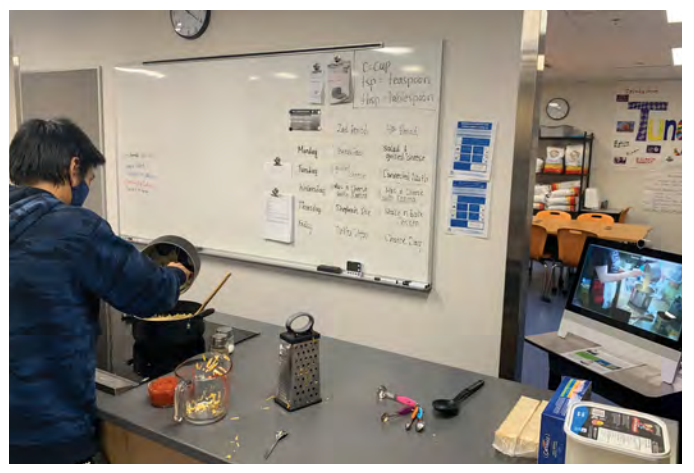
Interactive cooking demonstration