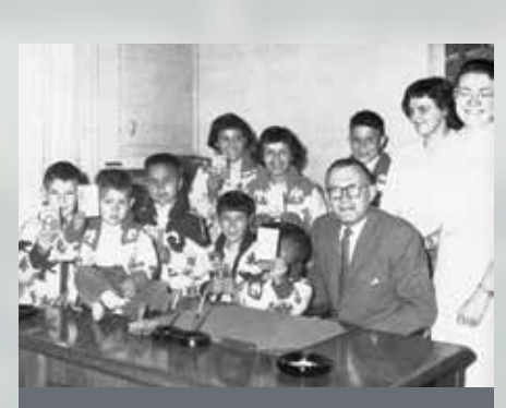
1961: Nine new clients open Royal Bank accounts in Terrace. B.C.