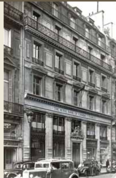
Royal Bank of Canada, France, circa 1950s.

Air travel was booming after the war so Royal Bank of Canada, France, opened a big branch and office in Paris to handle tourist banking. I was there for six months in 1950 and 1951 to help with the customer counter. The branch was right behind the Paris opera house, which I went to as often as possible. But after my second posting there I guess they wanted to cool me off. So they sent me to Goose Bay for the winter. During a snow storm there in February I received a telegram -- I was to transfer to St. Denis in Montreal as an assistant manager. That was good news! During the next few years I was also sent to several branches including Puerto Rico and Nassau. These were all temporary postings and then I was moved permanently to the Montreal head office.