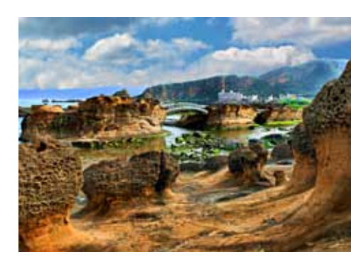
"These rock formations were forced by wind and sea erosions at the Geopark in Wanli District, New Taipei, Taiwan."