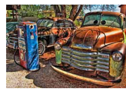
"Some antique cars appeal to me, like this rusted Chevrolet on the famous Route 66."