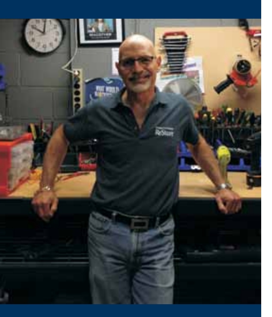
At his workbench at ReStore.

"We prevent things from being thrown in dumps. By rejuvenating and repairing, less things are thrown out. It's really great for a city's green footprint."