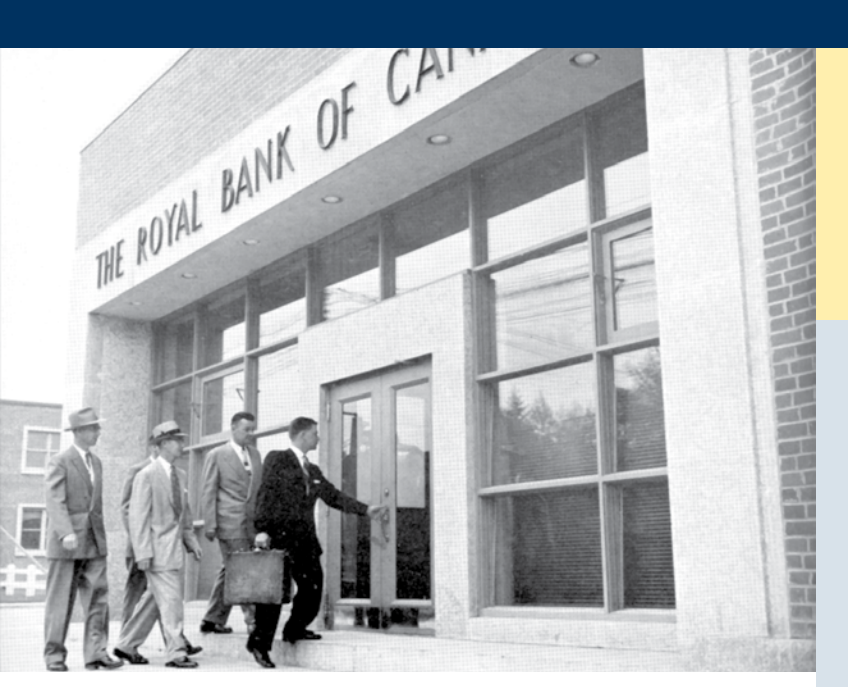
The Steinbach branch was ready for these RBC Inspectors in 1956. Now the branch is getting ready for celebrations and welcomes all who can attend.