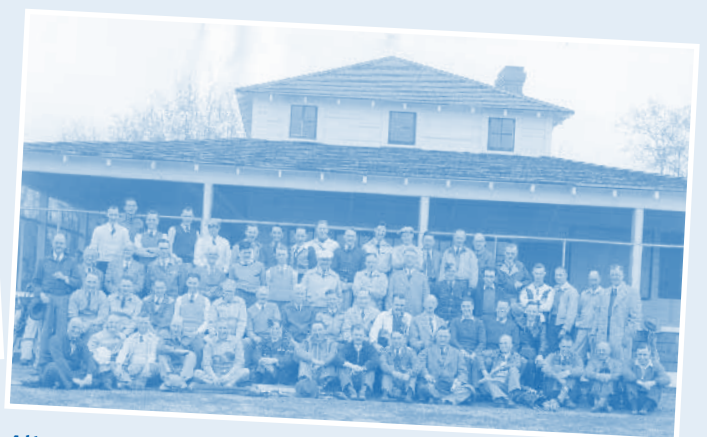
Alberta Staff Tournament, 1942