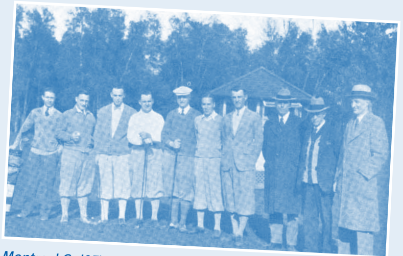
Montreal Golf Finals, 1930