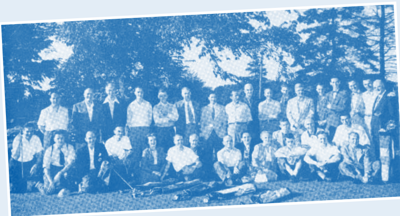
Central Nova Scotia Tournament, 1952