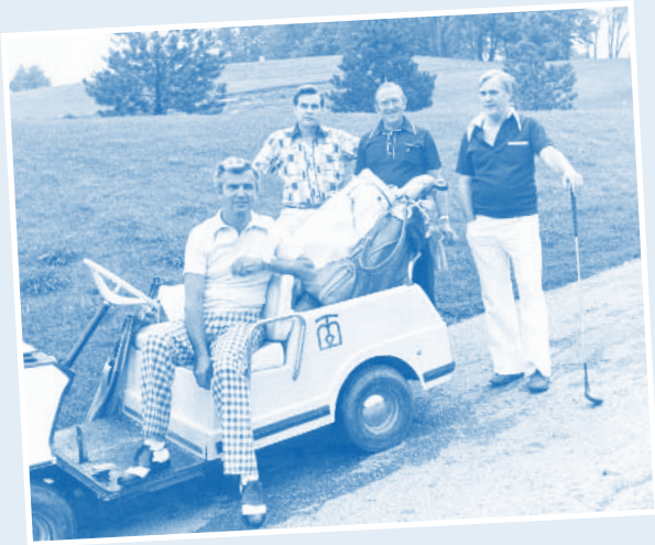
Senior Managers at Woodbridge Tournament, 1979

Long before the RBC Canadian Open existed, golf was a popular pastime for RBC employees. Captured here are memories of golf games long past.