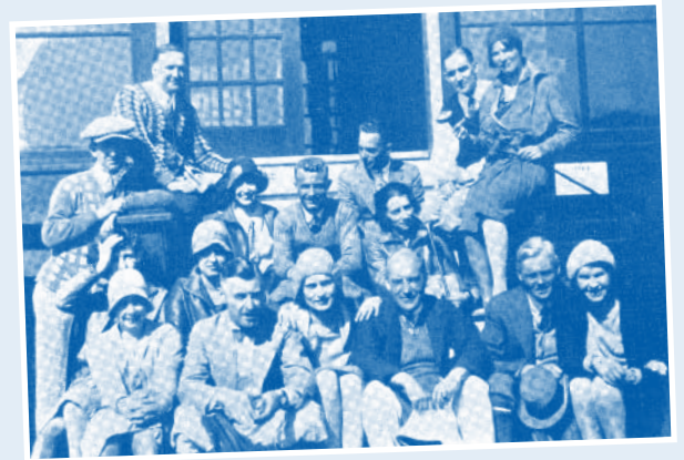
Calgary Supervisors Department Golf Tourney, 1930