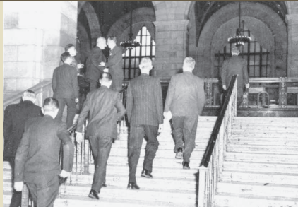
Montreal Main Branch - 360 St Jacques, 1948

Picture is reprinted from the book, Quick to the Frontier