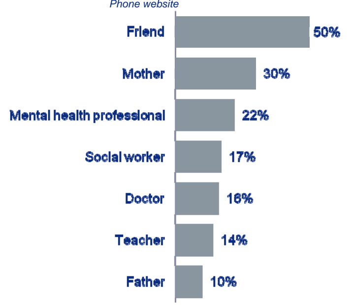
Base: 115 Canadian youth visiting the Kids Help Phone website